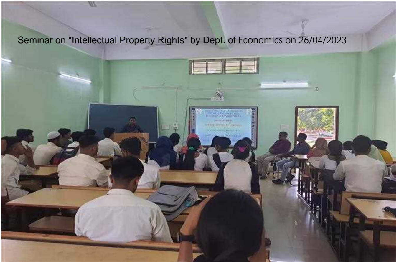
Seminar on "Intellectual Property Rights" by Dept. of Economics on 26/04/2023